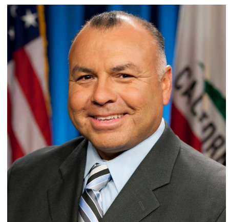
Assemblyman Freddie Rodriguez

California State Senator Josh Newman is also scheduled to visit the Bronco Bookstore in the near future!