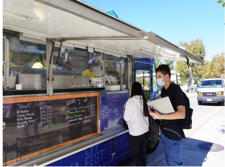
Students placing their food orders